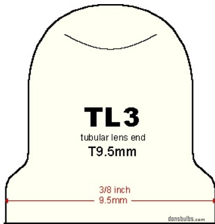
typical shape of TL3 glass envelopes (not to scale)