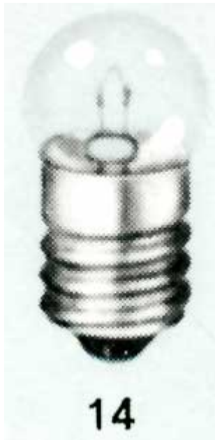
typical photo of 14 2.47V 0.3A USA bulb type (your bulb may look slightly different)

G11/2.5V/0.3A/E10 G11/2.5V/0.3A/E10-13 G11/2.5V/0.3A/E10/13 G11MM/2.5V/0.3A/E10 I/2.47V/0.3A/E10/G3.5 L14 AC/DELCO MICROSCOPE-31-29-46 BAUSCH/LOMB OPHTHALMIC-THORPE-SLIT-LAMP/71-71-25 BAUSCH/LOMB S464 IDEAL S465-IDEAL S6931 SATCO SLIT-LAMP GENERAL-ELECTRIC SLIT/LAMP GENERAL-ELECTRIC SLIT LAMP GENERAL-ELECTRIC SLITLAMP GENERALELECTRIC SM-14 USHIO SM/14 USHIO SM 14 USHIO SM14 USHIO T102 ALTAN THORPE-FIXATION BAUSCH/LOMB THORPE-SLIT-LAMP/71-71-25 BAUSCH/LOMB THORPE/FIXATION BAUSCH/LOMB THORPE FIXATION BAUSCH/LOMB THORPEFIXATION BAUSCH/LOMB W-L-00111/38 FEDERAL-STOCK-NUMBER