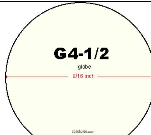
usual shape of G4-1/2 glass envelopes (not to scale)